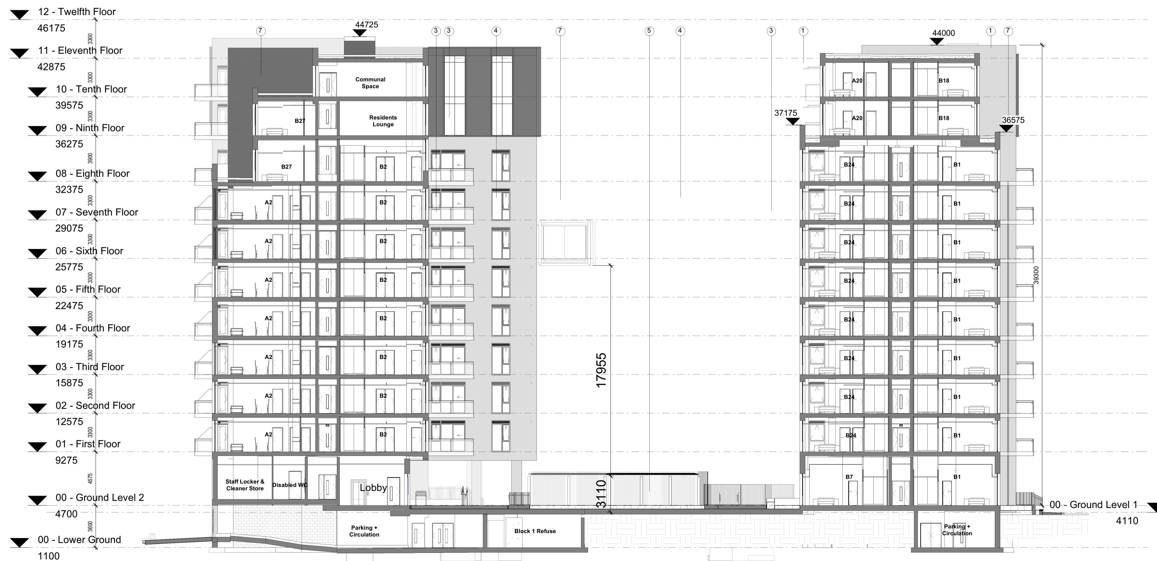
2 Block 1 - Section B-B 1 : 200

NOTE ALL DIMENSIONS TO BE CHECKED ON SITE NO DIMENSIONS TO BE SCALED FROM THIS DRAWING THIS DRAWING IS TO BE READ IN CONJUNCTION WITH RELEVANT CONSULTANTS DRAWINGS